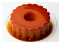
Pudim Abade Priscos