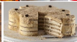
Bolo de bolacha