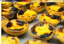
Pastel de nata