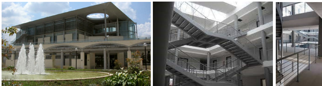
Studium 2000, Via di Valesio, Lecce

The Olivetani monastery is a convent in the city of Lecce, currently home to the Department of Historical Studies of the University of Salento; its foundation dates back to the late twelfth century. The monastery, located near the municipal cemetery, was probably built between 1171 and 1174 for the order of the black Benedictines. In the nineteenth century, the convent was acquired by the City of Lecce who used it as a public office and later as a hospice of begging. In 1985 the building was entrusted to the University of Salento, which restored it and made it a cultural center.