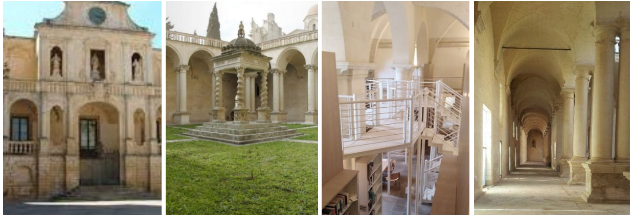
“Ex Monastero dei Monaci Olivetani”, Viale S. Nicola, Lecce

The conference will be held at “Ex Monastero dei Monaci Olivetani” and Studium 2000 at the University of Salento.