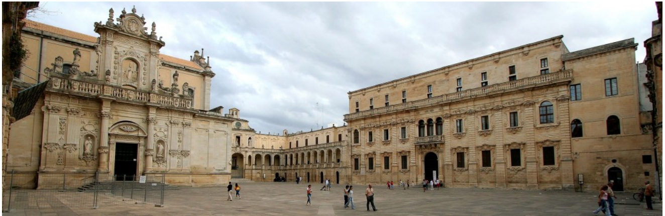
Piazza Duomo and the Cathedral