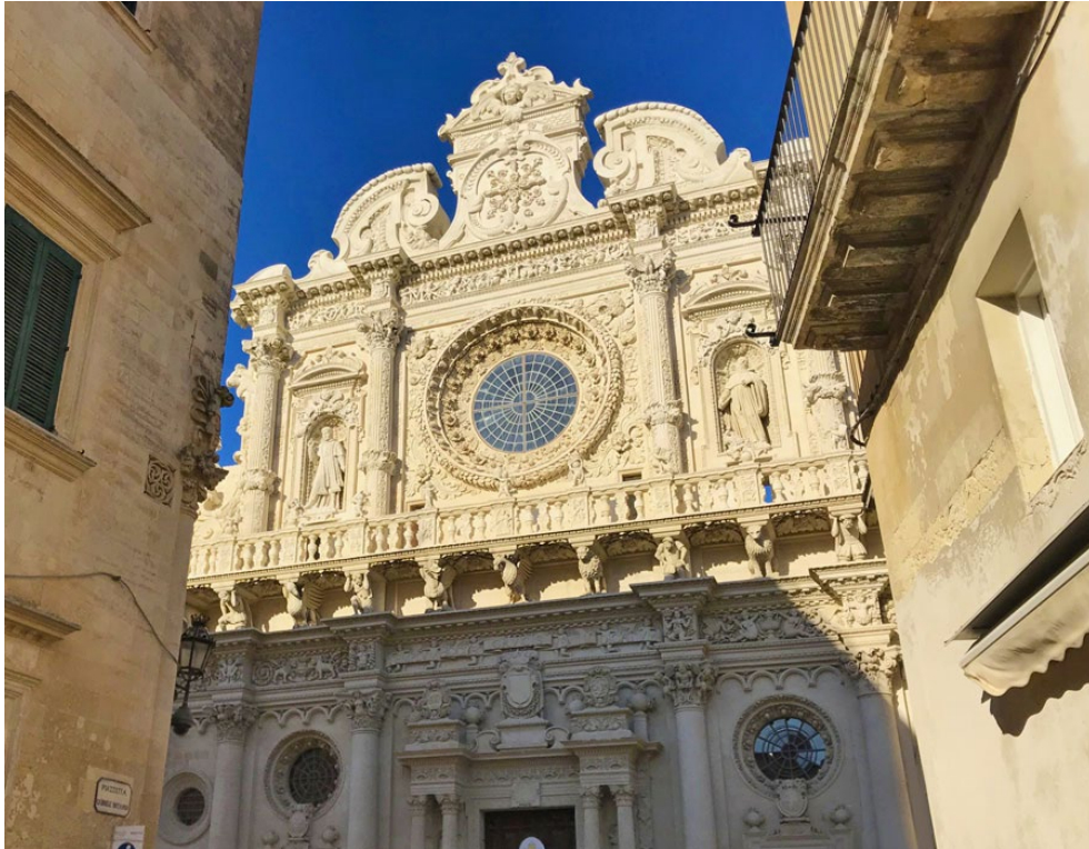
The Church of Santa Croce