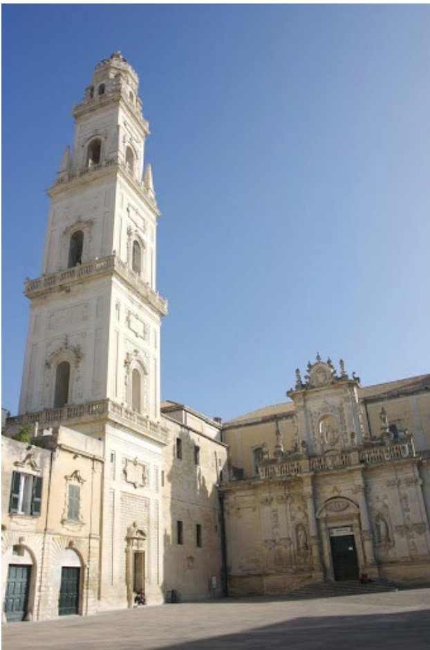
Cathedral Bell Tower