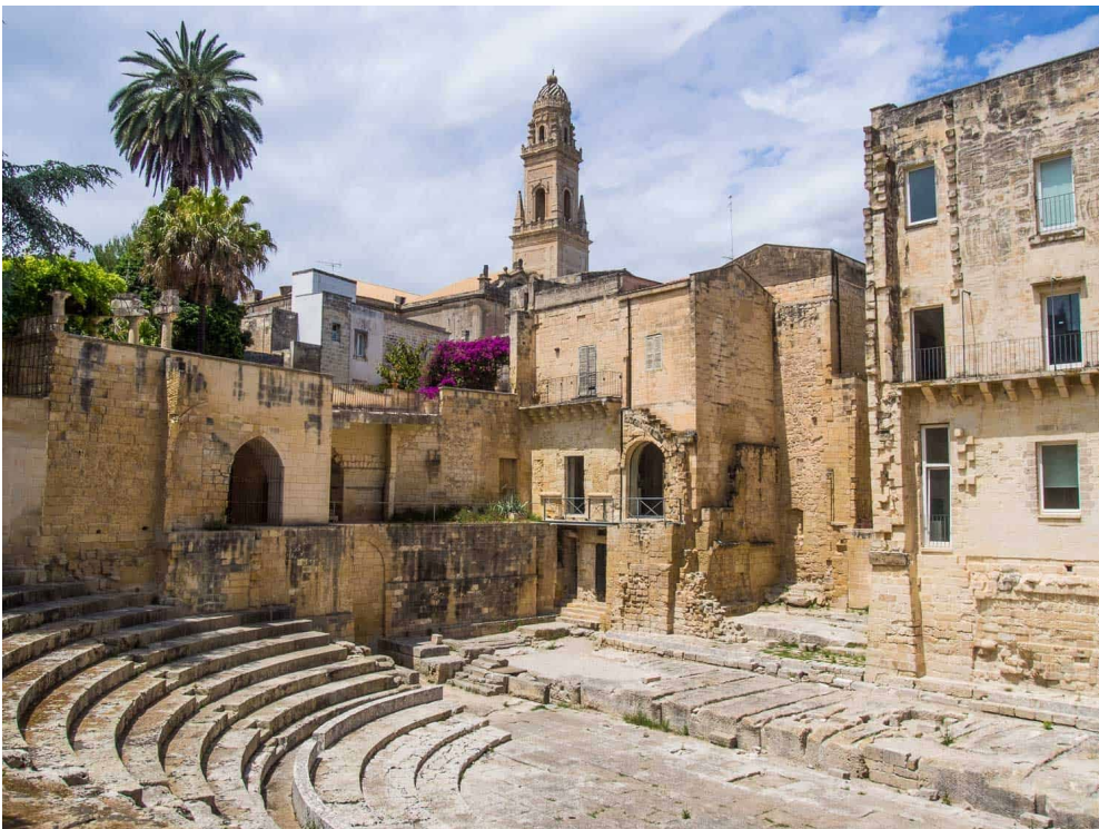
The Roman Theatre