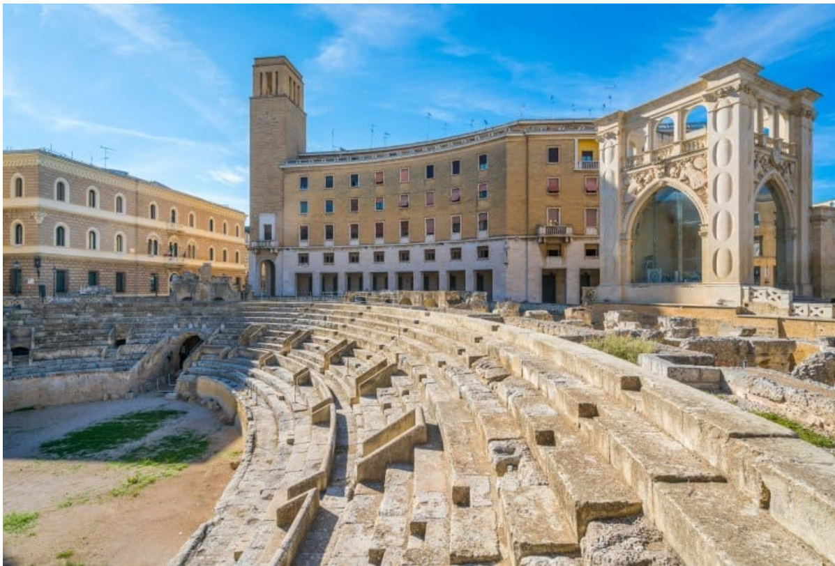
The Roman Amphitheatre