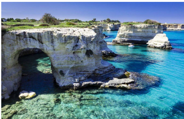
Santa Maria di Leuca