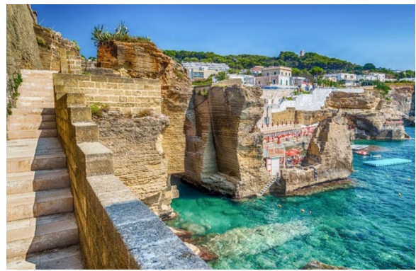
Santa Cesarea Terme